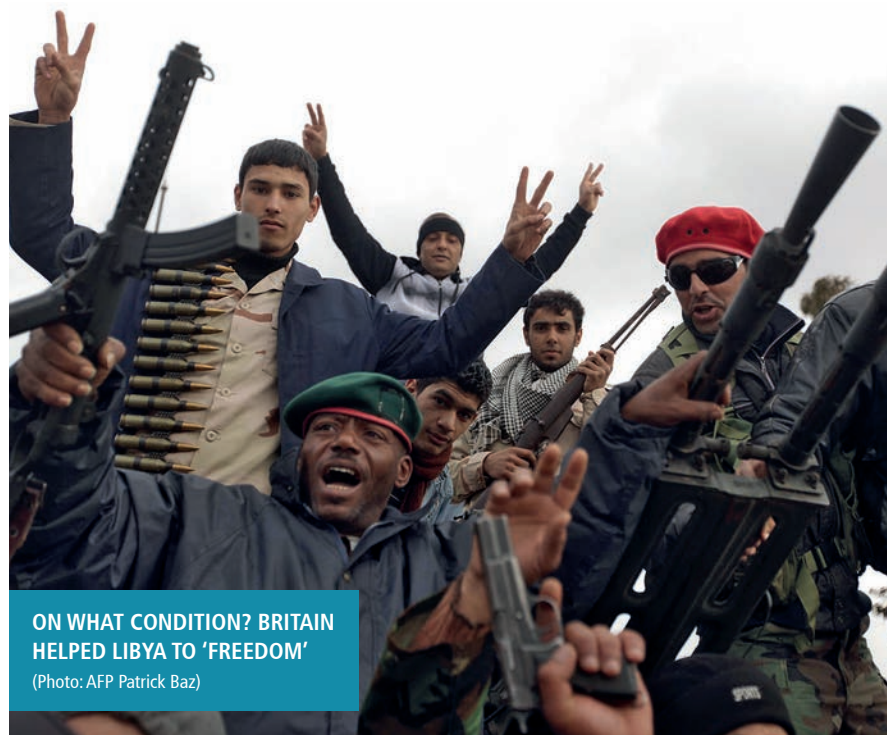
ON WHAT CONDITION? BRITAIN HELPED LIBYA TO 'FREEDOM'

'Admittedly this increased focus is "green shoots" but it is a start.'