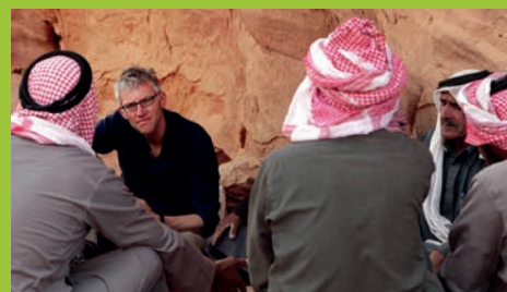
PRESENTER AND LAPIDO TRUSTEE TOM HOLLAND ON LOCATION.