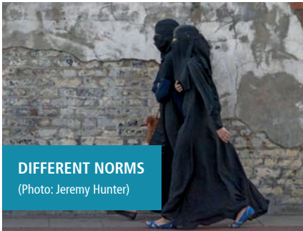
DIFFERENT NORMS

MORE HERE: http://www.lapidomedia.com/muslim-girls-miss-own-weddings