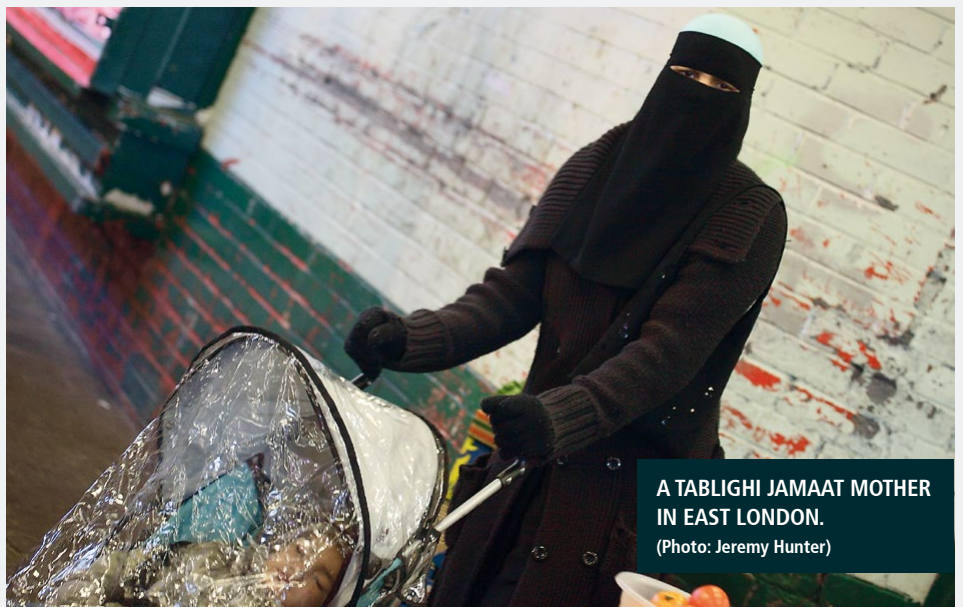
A TABLIGHI JAMAAT MOTHER IN EAST LONDON.